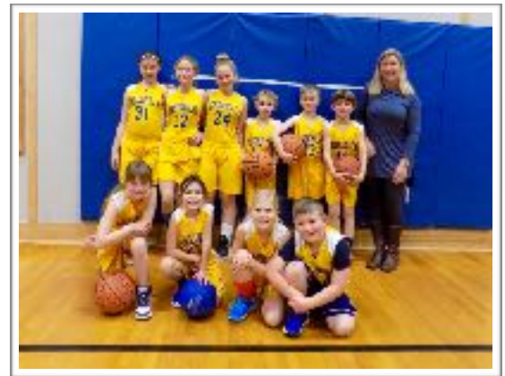
Brooklin School B-Team