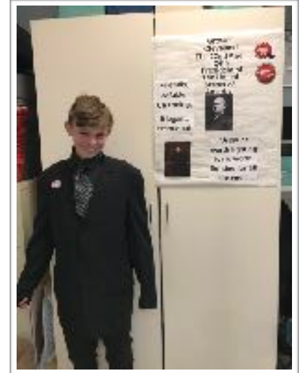
Here I am as Grover Cleveland, the 22nd and 24th president of the United States.

The classes that participated in The Wax Museum were 3/4, 5/6, and 7/8. 3/4's main focus was American innovators, 5/6's was the Romans, and my class, The 7/8's was dead presidents and first ladies. People in our community came to see us and there were a lot of them who showed up. In my class, I dressed up as Grover Cleveland and wrote a speech about him. Everybody who participated made a speech and a poster with facts, quotes, and pictures of their person. Overall, I think it went well for it being the first time for a lot of us and I think we will do it again in the future. All of us students were instructed to walk around and take notes about our other classmates presentations. I think that was a really good idea because not only did we learn about our assigned character, we got to learn about mostly everybody else's characters too.