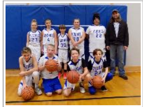
Brooklin School A-Team